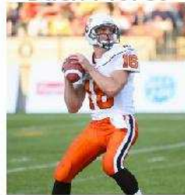
In 4 Games Played