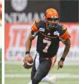
In 2 Games Played

653 passing yards 4 TD's 5 INT's 71.7 QB Rating